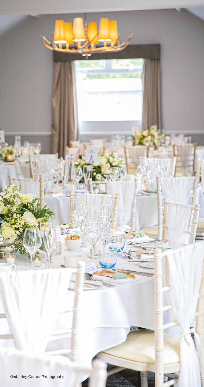
Kimberley Garrod Photography