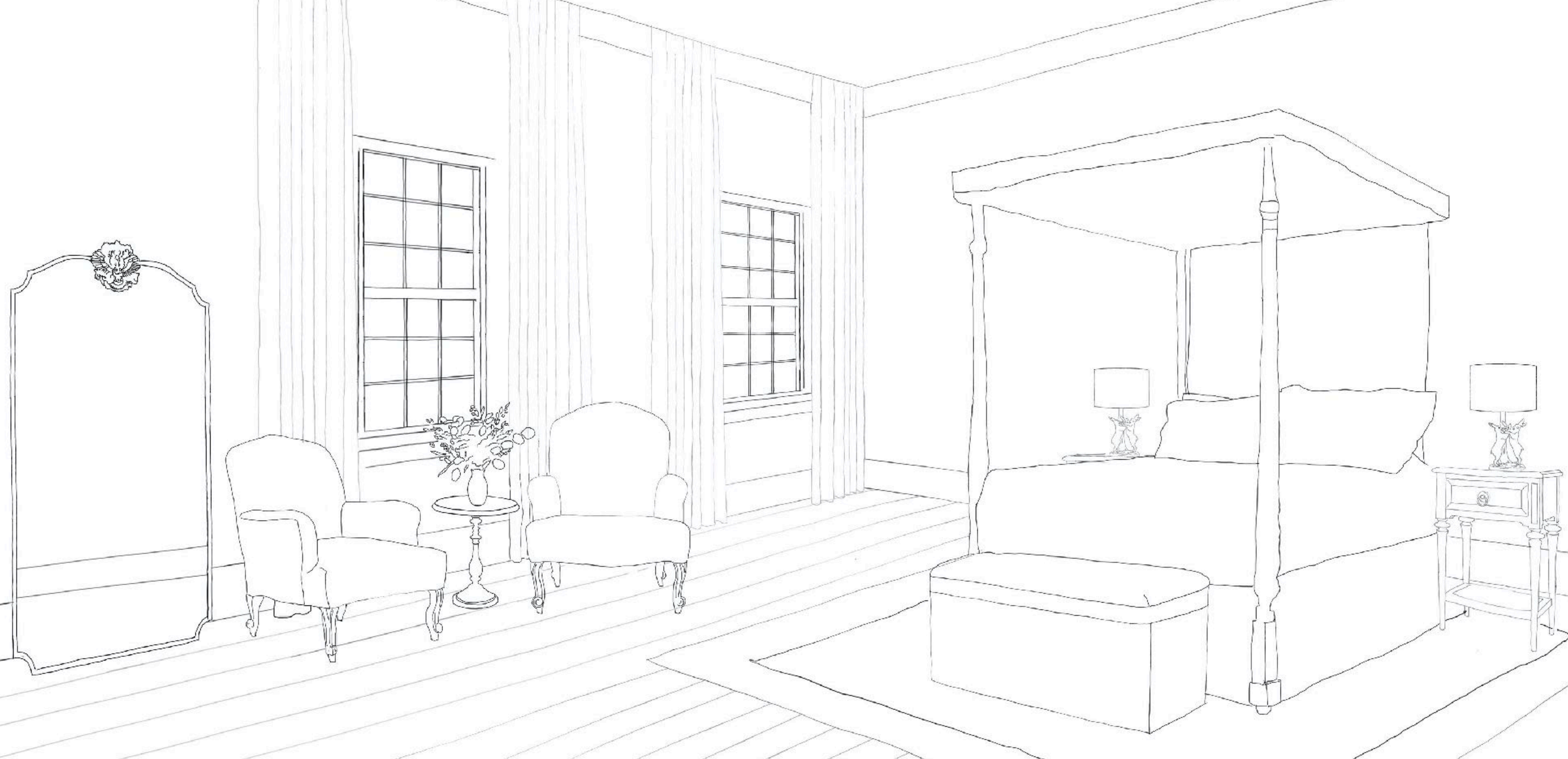
Artist's illustration of the beautiful Honeymoon Suite at Stockton House with stylish interior design, four-poster bed, roll-top bath and views over the Shropshire countryside