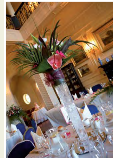
Above: The Grand Hall can also be used for dining.

Individual Lemon Meringue Pie, Lemon Curd & Mint Caviar