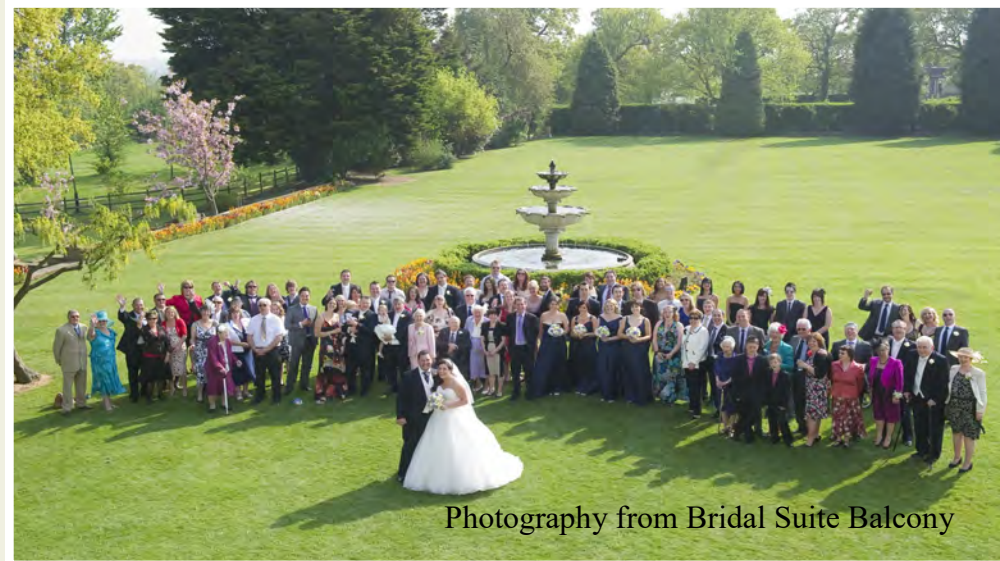
Photography from Bridal Suite Balcony