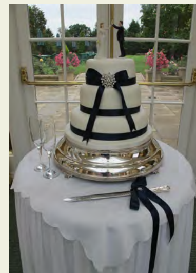
Below: Silver round cake stand and knife free for your use.