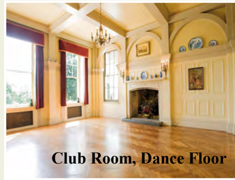
Club Room, Dance Floor