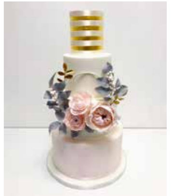
Sugar Design Cakes