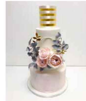
Sugar Design Cakes

For a list of our recommended caterers please ask our wedding coordinators