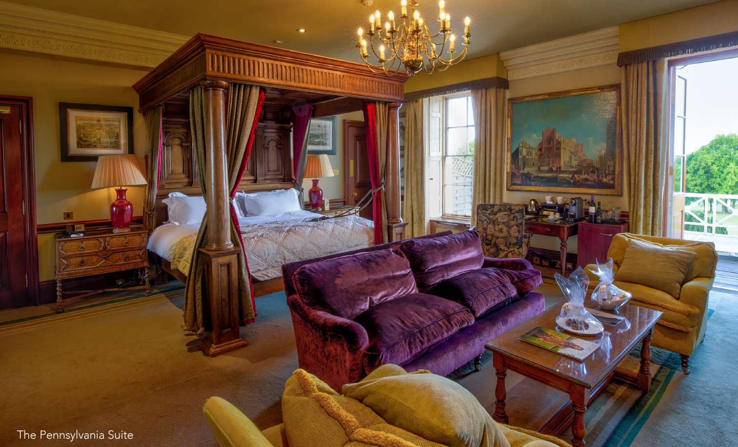
The Pennsylvania Suite