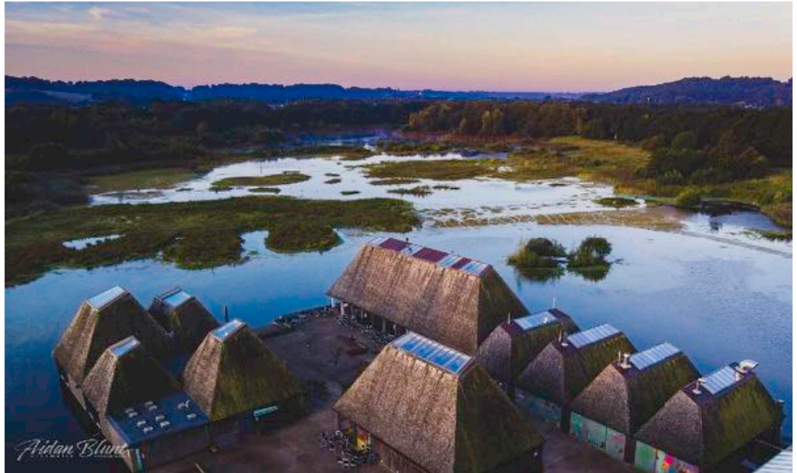
Drone shot of reception location - Brockholes

Good film editing takes time so I restrict the number of projects I film each year to