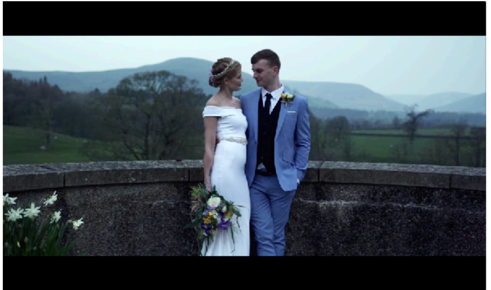
Screen shot from Inn at Whitewell wedding

Whilst the documentary edit will give you a very clear description of the events of the day the cinematic edit will affect you on a deeper emotional level as it brings back your memories, your thoughts and