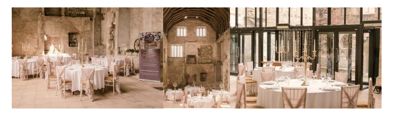
Add ceremony - £250.00 I Additional day guest - £8.50pp I Additional evening guest - £3.00pp