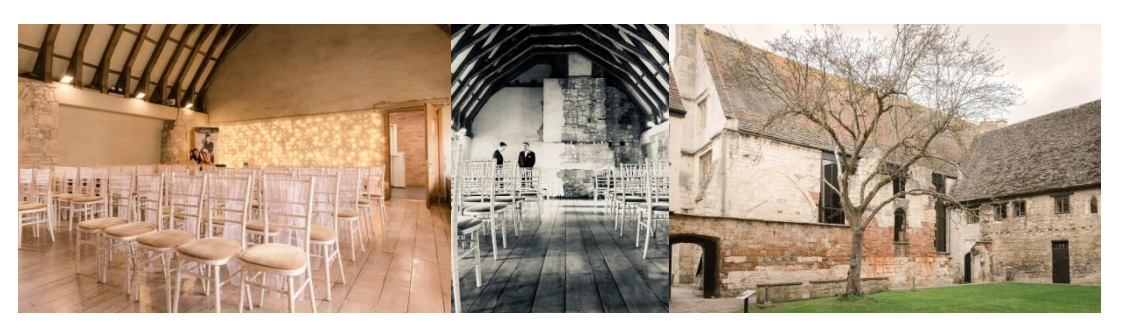
Add Ceremony - £250.00