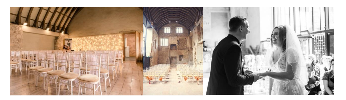
Additional guests for North Range Ceremony - £8.50pp