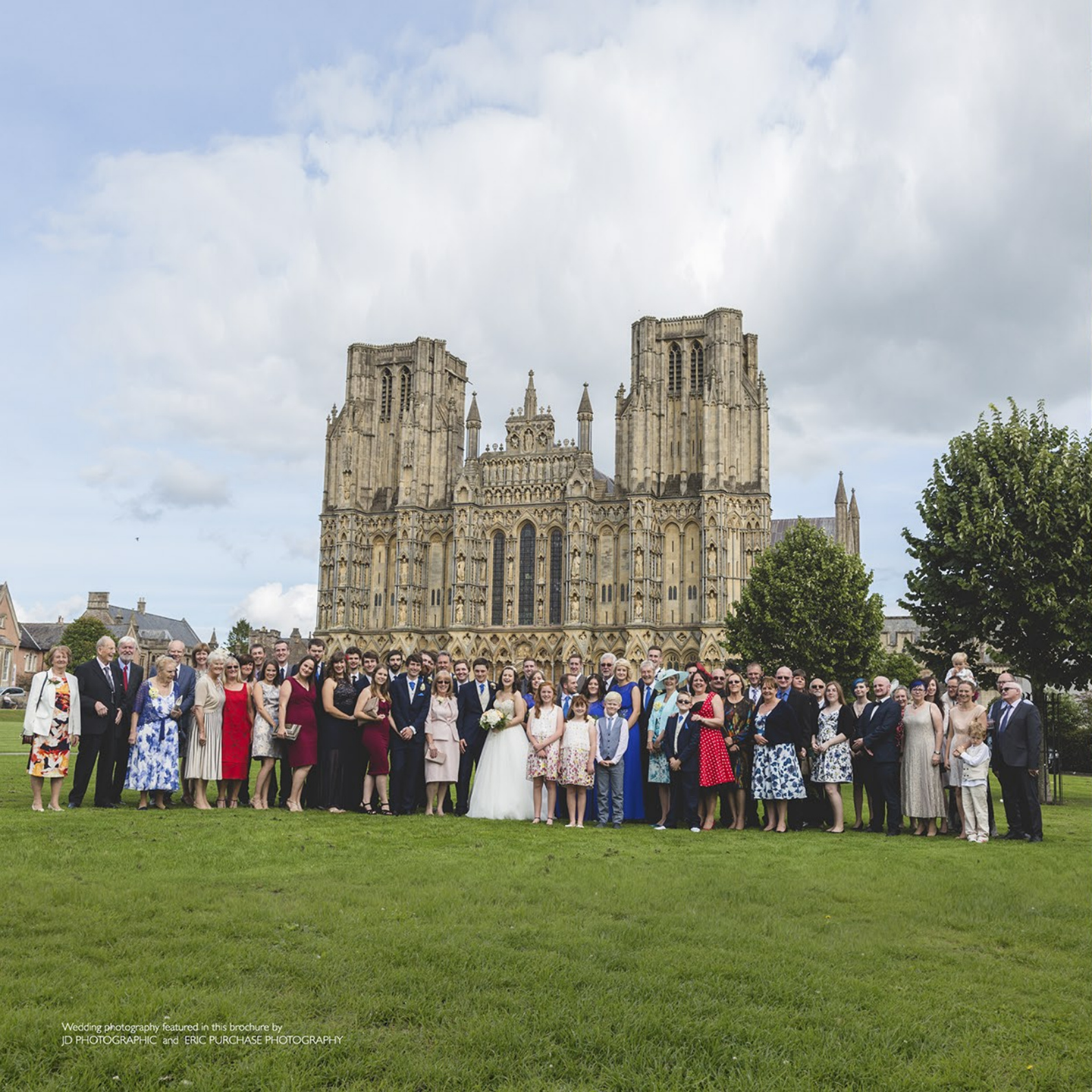
Wedding photography featured in this brochure by JD PHOTOGRAPHIC and ERIC PURCHASE PHOTOGRAPHY

LET US MAKE THE FIRST DAY OF YOUR LIFE TOGETHER VERY SPECIAL