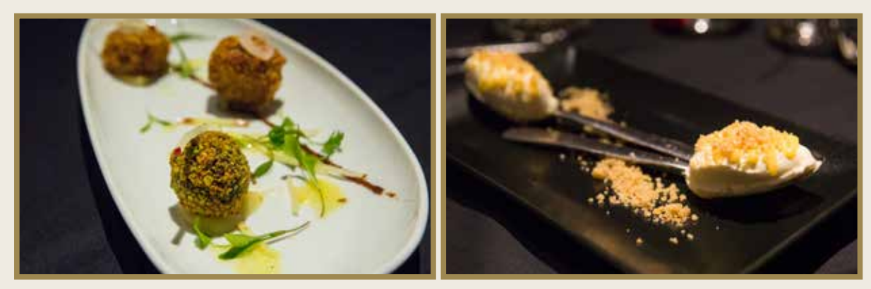
Alnwick Castle prides itself on offering varied Wedding menus which are locally sourced and prepared to the highest standard by our brigade of chefs.

Our Head Chef would be delighted to prepare a bespoke menu to suit your own individual requirements